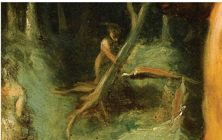
Cornelis Cornelisz. van Haarlem, The Labours of Hercules (Detail)

In comparison to some of van Haarlem's other works, The Labours of Hercules can be considered restrained in mood, and in this it is comparable to another work in the Hermitage, Head of a Young Woman (Venus?) (fig. 4). There is a tranquillity to this portrait that allows the viewer to contemplate the young woman's beauty without distraction. Similarly the restrained drama of the present work, with the simple dynamic thrust of Hercules' right arm, allows the viewer to focus wholly on the depiction of the male nude. This mood does not detract in any way from the picture because van Haarlem still depicts a number of different creatures which provide the same diverting detail that is present in works such as Hercules and Acheloius and Two Followers of Cadmus Devoured by a Dragon . The male nude features so prominently throughout van Haarlem's work that one senses that The Labours of Hercules is a truer