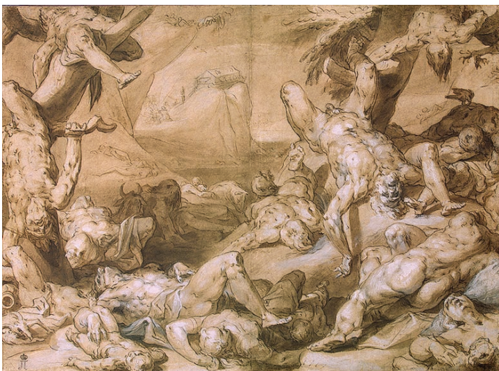
Cornelis Cornelisz. van Haarlem, After the Deluge , 1588, The Hermitage, St. Petersburg (Figure 3)

Van Haarlem depicted Hercules on several occasions, another example being Hercules and Acheloüs , which was sold by Christie's, New York in 2008 for $8,105,000, and which now hangs in the Metropolitan Museum of Art, New York (fig. 1). In both works the central figures have been pushed to the very front of the picture plane so that Hercules' skilfully rendered musculature has the greatest impact. The scene in Hercules and Acheloüs is frenzied in comparison to the more concise drama of the present work but the paintings both share the focus of the hero's brute strength. In Hercules and Acheloüs , van Haarlem highlights the tensed arms and knee of Hercules, as he prepares to rip the horns from the massive bull's head, whereas in The Labours of Hercules the viewer can contemplate the male nude as a whole. As in the present work van Haarlem has painted an additional vignette in the background of Hercules and Acheloüs , which helps to contextualise the foreground scene. In both works,