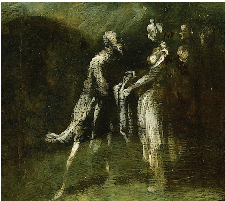
Cornelis Cornelisz. van Haarlem, The Labours of Hercules (Detail)

to the Hermitage's collection. This drawing shows the aftermath of the great flood sent by God to purge the world of man's evil. Noah's Ark, however, has been placed in the background atop Mount Arafat, and this subordination of the narrative to the art is comparable to van Haarlem's treatment of Hercules' labours, in the present work. In both works these details serve to contextualise the narrative, but van Haarlem does not allow them to detract from the striking male nude. In After the Deluge , the nude is examined from a variety of angles and in a variety of contorted poses. Despite the fact that these corpses have been submerged for months, their bodies are still idealised, with heavily defined musculature. It is noticeable that although some women and children have been depicted, they have not been given the same prominence accorded to the male nude.