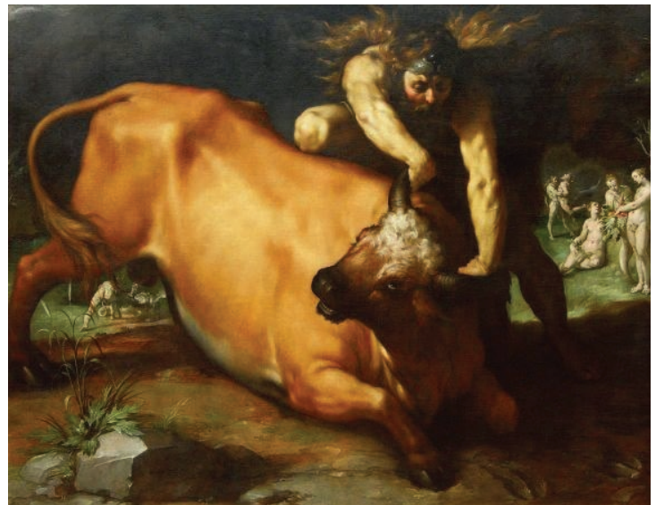
Cornelis Cornelisz. van Haarlem, Hercules and Achelöis , 1590, Private Collection (Figure 1)

In The Labours of Hercules , Cornelis Cornelisz. van Haarlem has depicted the great hero gesturing towards the heavens while standing amidst the bodies of several of the great creatures that he has slain or captured as part of his twelve labours. These bodies are those of the Nemean Lion, the Erymanthian