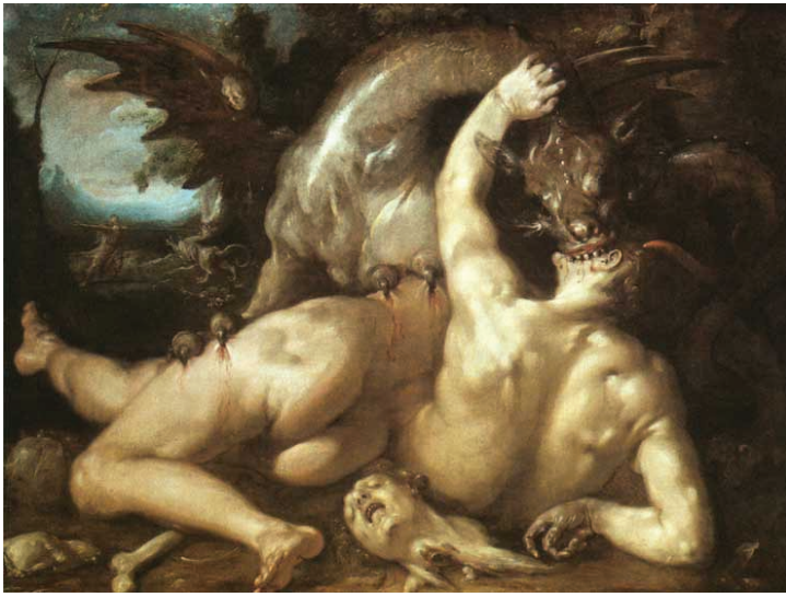
Cornelis Cornelisz. van Haarlem, Two Followers of Cadmus Devoured by a Dragon , 1588, The National Gallery, London (Figure 2)

Surrounded by the spoils of his monumental deeds, Hercules himself stands against a gloomy, forbidding landscape. His powerful nude body, seen from behind, entirely dominates the canvas. In his left hand he grasps his famous club, while gesturing dramatically skywards with his right, his muscle-bound body taut with emotion. Van Haarlem's focus is a study of the idealised male nude, epitomised by this demi-god. Hercules' physique is the focus of the work, the depiction of his labours deliberately secondary, despite their lively detail.