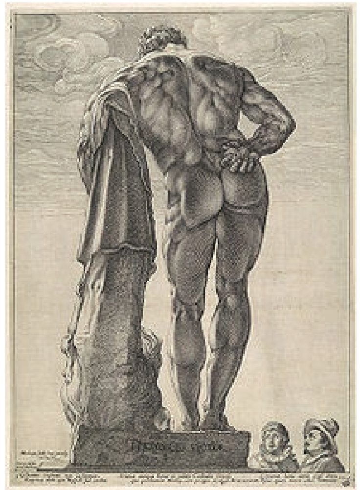
Hendrick Goltzius, Farnese Hercules , c. 1592, The Metropolitan Museum of Art, New York (Figure 5)

Goltzius' etching of the ancient Roman statue Farnese Hercules , see figure