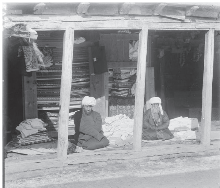
Sergei Mikhailovich Prokudin-Gorskii, Fabric Merchants in the Registan, Samarkand , photograph, c. 1905-1915, Library of Congress Prints and Photographs Division, Washington D.C. (Figure 1)

Before the present work was painted there was a established tradition in Russia of recording the alien exoticism of Samarkand. The Russian empire was so vast that there was a natural interest in Western Russia into the cultural diversity that could be found across the Empire. As one of the great cities of Central Asia, Samarkand was the subject of much of this interest. Perhaps the best example