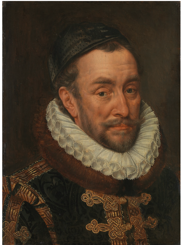
Adriaen Thomasz. Key, Portrait of William I (1544-84), Prince of Orange , 1579, Rijksmuseum, Amsterdam (Figure 2)

in his larger, three-quarter length works, Key occasionally included extra, symbolic elements, to refer to a particular aspect of his subject's character. One such example is the Pushkin Museum's Portrait of a Man , painted just a year before the present work (fig. 3). As is typical of Key, 'objective and reserved, he explored every wrinkle and crack in the face and hands and sculpted anatomical relief, as it were, with light and colour'. 5 Much of the work is reminiscent of Portrait of a Bearded Gentleman , and yet on the table beside him 'money, a ledger, pen, compass, nutcracker and salt tub leave little room for doubt that the man in question was an international