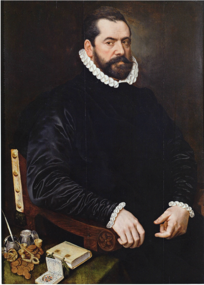
Adriaen Thomasz. Key, Portrait of a Man , 1573, Pushkin Museum, Moscow (Figure 3)

dealer in spices'. 6 Perhaps Key's use of symbolism is most notable in the Prado's masterpiece of 1583 Family Portrait , see figure 4, which contains the vanitas symbols of a skull and an hourglass. However, in when one compares these works which have elements of iconography, to the present work, they lack some of immediacy of Portrait of a Bearded Gentleman . Such is the vitality which Key subtly imbues within his subjects, that the extra details feel almost distracting, and derive from the visual power of the portrait. Jonckheere has suggested that in the case of Family Portrait , Key has deliberately dulled the eyes of the father, one of a number of reasons he cites to suggest that the father may have actually died, and that this is a memorial portrait. 7 This theory has yet to be proved, but in the context of the tremendous psychological depth which Key's subjects generally have, the Prado's father is conspicuous.