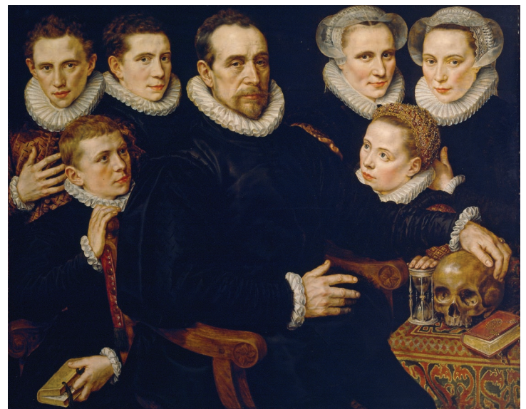
Adriaen Thomasz. Key, Family Portrait , 1583, The Prado, Madrid (Figure 4)