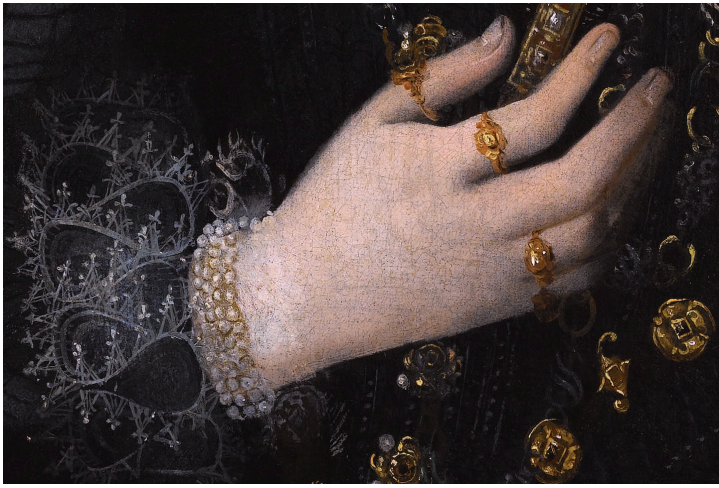
Juan Pantoja de la Cruz, Portrait of a Lady of the Court of Phillip III (Detail)

Close observation of Portrait of a Lady of the Court of Philip III reveals a pendimenti of a wider ruff suggesting Juan Pantoja de la Cruz had originally conceived of the painting with an extensive ruff - perhaps similar to the one worn in Portrait of a Lady Wearing a Large Ruff - but subsequently reduced it to its current size. These larger ruffs became particularly popular in the later sixteenth-century and were decorated with increasing amounts of lace (fig. 1).