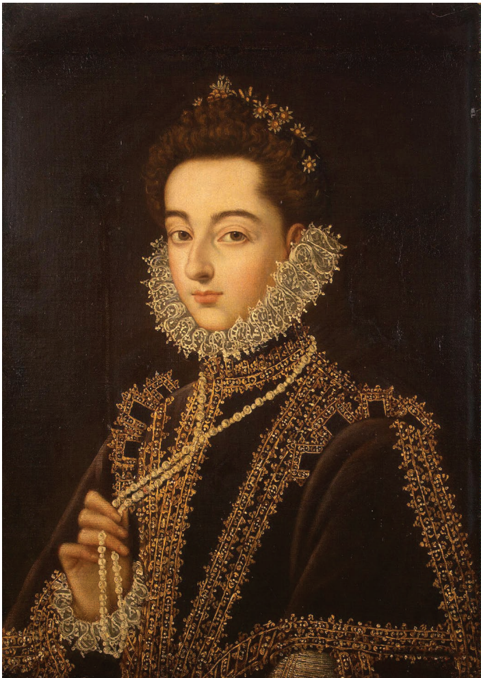
Alonso Sánchez Coello, Portrait of the Infanta Catalina Michaela of Austria , between 1582 and 1585, The Hermitage, St. Petersburg (Figure 2)

Between 1600 and 1607 Pantoja painted sixty-six portraits of thirty-nine different members of the royal family as well as other members of the aristocracy. Although the identity of this woman is unknown, she is