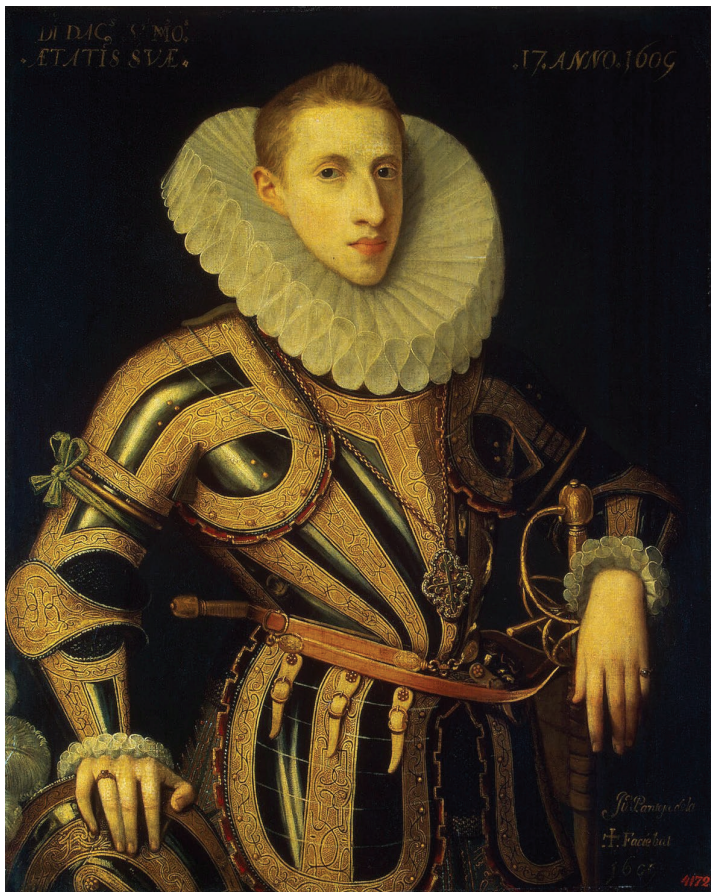
Juan Pantoja de la Cruz, Portrait of Diego de Villamayor , 1605, The Hermitage, St. Petersburg (Figure 3)

Pantoja's Portrait of Diego de Villamayor , originally part of the renowned collection of the Amsterdam banker William Coesvelt, and one of the first Spanish paintings to be acquired by the Hermitage, reveals the artist's preference for capturing his sitters' likenesses in a hieratic fashion, emphasising their status and authority (fig. 3). Like the noblewoman in the present portrait, de Villamayor is portrayed against a dark background, which serves to highlight the intricate detail of his magnificent suit of armour. His strong facial features are boldly delineated and emphasised by the heavy ruff around his neck.