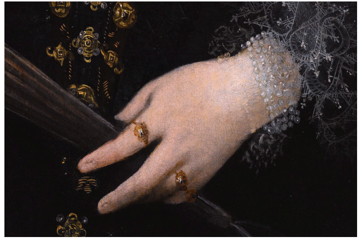
Juan Pantoja de la Cruz, Portrait of a Lady of the Court of Phillip III (Detail)

most likely a member of the extended royal family, the wife of a courtier of Phillip III (1578-1621) or a lady-in-waiting to his wife, Margaret of Austria (1584-1611).