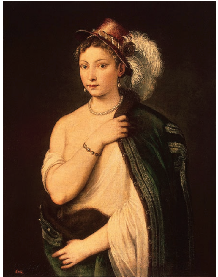
Titian, Portrait of a Woman , c.1536, The Hermitage, St. Petersburg (Figure 4)