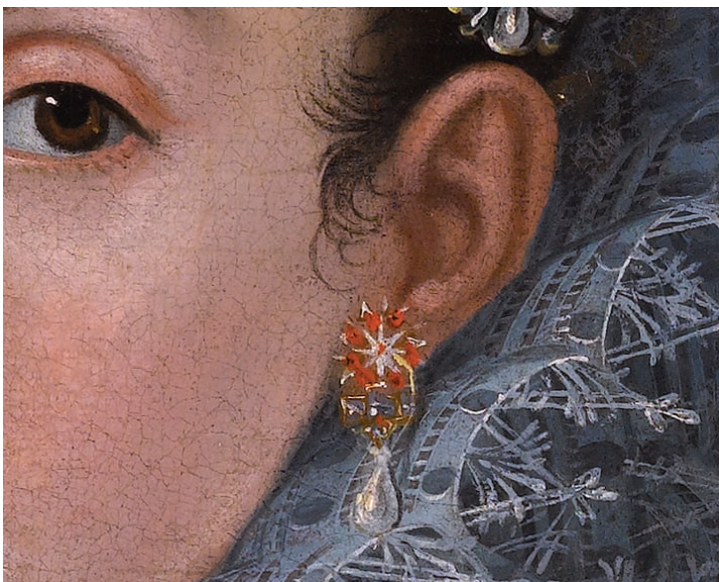
Juan Pantoja de la Cruz, Portrait of a Lady of the Court of Phillip III (Detail)