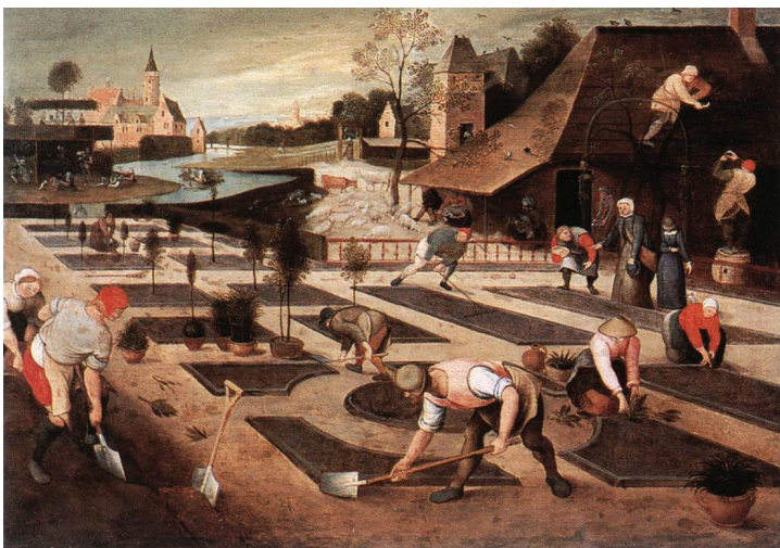
Abel Grimmer, Spring , 1607, Koninklijk Museum, Antwerp (Figure 1)

Grimmer is known principally for his numerous small-scale paintings of country scenes, sometimes with biblical themes. Often his works form part of a series of the four seasons or the months of the year and no doubt this present work followed the same format. A complete series of the four seasons is held in the Koninklijk Museum, Antwerp, two of which, Spring