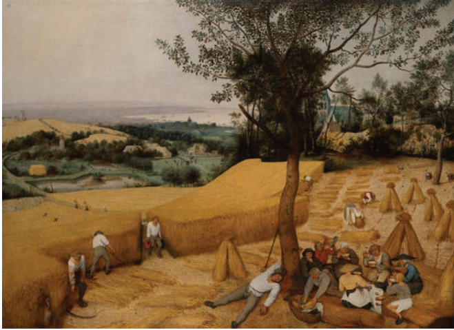
Pieter Brueghel the Elder, The Harvesters , 1565, The Metropolitan Museum of Art, New York (Figure 4)

as a couple gathers wheat into bundles, three men cut stalks with scythes, and several women make their way through the wheat field with stacks of grain over their shoulders. The vast panorama across the rest of the composition reveals that Brueghel's emphasis is not on the labours that mark the time of the year, but on the atmosphere and transformation of the landscape itself.