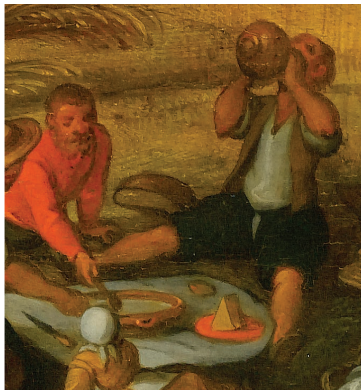
Abel Grimmer, An Allegory of Summer (Detail)

Netherlandish art with the Da Costa Book of Hours (c.1515, Pierpont Morgan Library, New York) by the native Bruges artist, Simon Bening (1483/4-1561). 1 The importance of the innovations heralded by manuscript illumination in the northern Netherlands was not lost on Grimmer given that, in a fashion similar to the Limbourg brothers' illustration of July, see fig. 3, he too includes landscape, architecture and a highly accurate iconography of the seasons. In An Allegory of Summer with Three Signs of the Zodiac (fig. 5), the season is made recognisable by the weather and the activities of the figures depicted. The signs of the zodiac in the sky also identify the time of year. Signs of the zodiac are rare in Grimmer's work and do not feature in An Allegory of Summer . Their inclusion in An Allegory of Summer with Three Signs of the Zodiac , however, demonstrates his clear knowledge of the traditions and techniques of manuscript illumination.