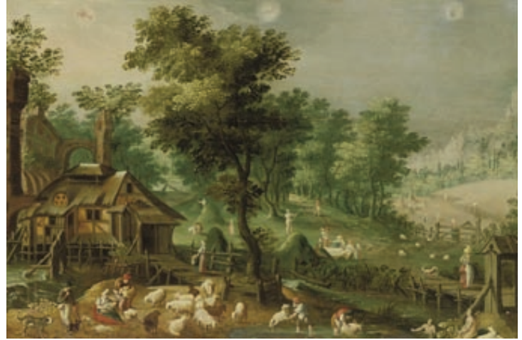
Abel Grimmer, An Allegory of Summer with Three Signs of the Zodiac: A Wooded Landscape with Peasants Shearing Sheep and Harvesting Corn , Private Collection (Figure 5)

the finest landscapists of his time and of whom van Mander made the claim that he knew of no other artist who was so 'outstandingly skilled in landscapes'. 5 Jacob Grimmer was one of the first Netherlandish artists to break with the tradition of the mountain landscape pioneered by Patenir. Instead he depicted broad landscapes of the Flemish countryside, as exemplified in his Four Seasons of 1575 which were executed ten years after Brueghel's six panels of the months (fig. 6). Although Grimmer's An Allegory of Summer is akin to his father's Four Seasons both in its naturalism and close observation of nature, it is also individual in style and distinct from Jacob Grimmer's panels.