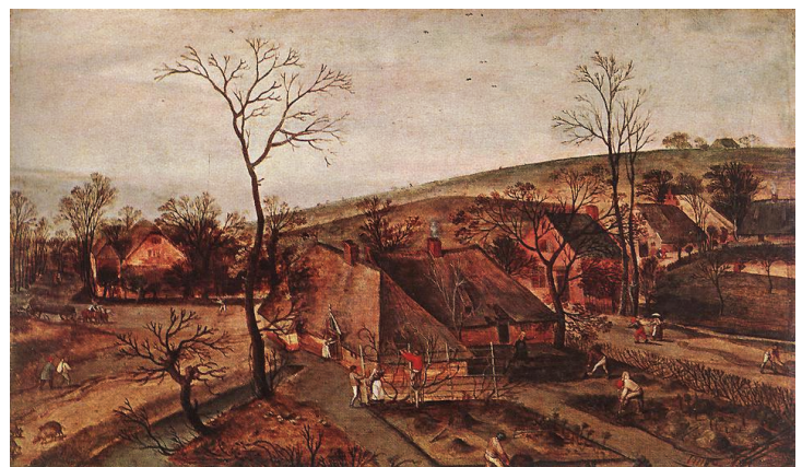
Jacob Grimmer, Spring , Museum of Fine Arts, Budapest (Figure 6)

Born in 1570, Grimmer became a master in the Antwerp Guild of St. Luke in 1592. His paintings owe much to his father's style as well as to Brueghel the Elder, as discussed above. Grimmer often copied prints engraved by Pieter van der Heyden (c.1530-1572) after designs by Brueghel and the artist Hans Bol (1534-1593). 6 His series of the Twelve Months (1592, Montfaucon-en-Velay, Haute-Loire, Chapelle Nôtre-Dame), for instance, are exact copies of Adriaen Collaert's prints after Bol. 7 While he also painted church interiors and other architecturally inspired pieces, Grimmer is perhaps best known for his depictions of peasants at work or leisure in the outdoors as in An Allegory of Summer .