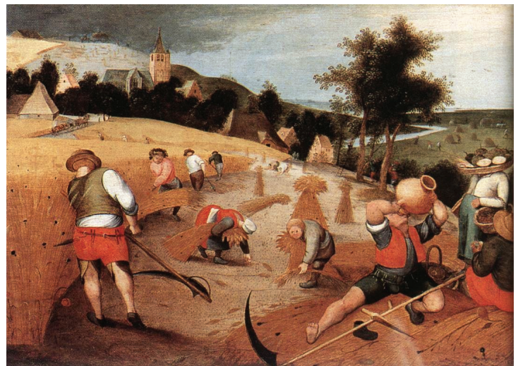
Abel Grimmer, Summer , 1607, Koninklijk Museum, Antwerp (Figure 2)

SEEKING SHADE FROM THE FIERCE SUMMER SUN, A group of harvesters recline under the boughs of a tree sharing a simple meal of bread and cheese. The whole scene bustles with activity as a number of labourers still toil in the field beyond, gathering the carefully scythed corn into neat stooks. Men, women and children all lend a hand giving a sense of dynamic community to the work. A little child dressed in a white smock can be seen wrestling with a bundle of corn far too big for her to manage. Another young child sits in the shade, his back to the viewer as he thirstily drinks from the bowl of milk that has been set upon a spotless, white table cloth. In bare feet a man and a woman frame the activity of the harvesters' merry picnic; the woman bending forward to eat while the man leans back to drain a flagon of ale. With their hats and scythes cast aside for the brief respite provided by their meal, this group stands in contrast to the hard work still going on behind them. A little dog mischievously sniffs the picnic basket next to his unsuspecting owners, who are oblivious to everything except resting their weary limbs and sating their hunger. This imbues the ritual of the harvest with a sense of light hearted realism.