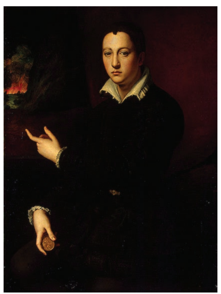
Attributed to Agnolo Bronzino, Portrait of Cosimo I Medici , 1537, The Hermitage, St. Petersburg (Figure 3)

and with her right she pets her black squirrel as it sits on a red draped table, wearing a red and silver bell lined collar.<sup>2</sup> Unusual domesticated pets, such as squirrels, were not uncommon during the Renaissance and were particularly popular companions for elegant ladies, who usually adorned them with collars decorated with bells.<sup>3</sup>