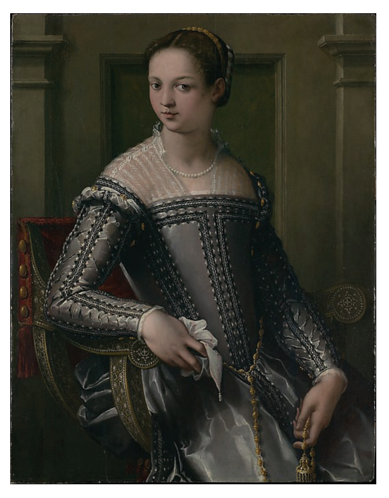
Florentine School, 16th Century, Portrait of a Woman The Metropolitan Museum of Art, New York (Figure 4)

c.1602) as well as Vasari himself. Such a commission would have been hugely prestigious for the young Traballesi.