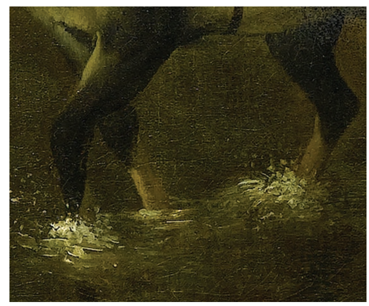
Jan Siberechts, A Wooded Landscape with Peasants in a Horse-Drawn Cart Travelling Down a Flooded Road (Detail)

1661, however, Siberechts had moved away from the work of the Dutch Italianates and developed his own personal style combining genre with landscape painting.