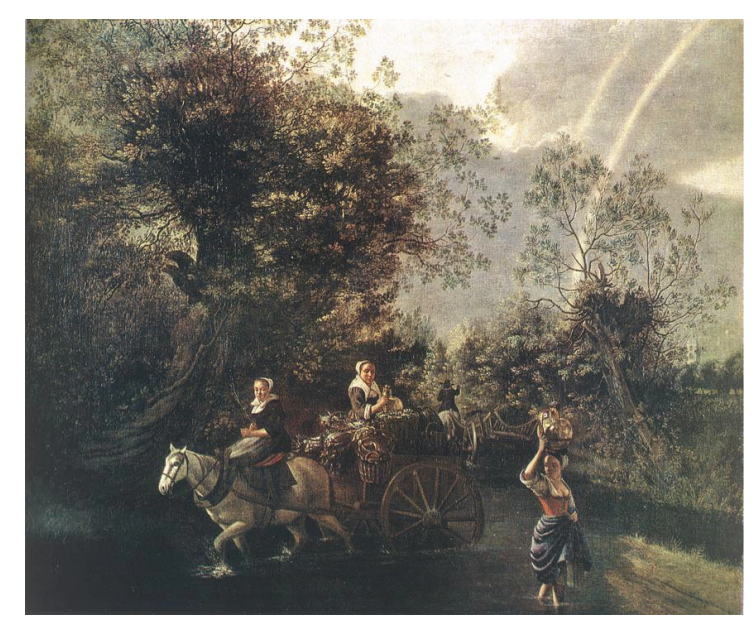
Jan Siberechts, Crossing a Creek, 1669, Pushkin Museum, Moscow (Figure 1)

waters. A similar composition, now in the Pushkin Museum, Moscow, shows an almost identical representation of the delicate splashes made by a slow-moving, heavily laden horse and its cart (fig. 1)