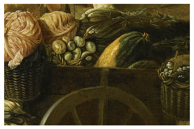
Jan Siberechts, A Wooded Landscape with Peasants in a Horse-Drawn Cart Travelling Down a Flooded Road (Detail)

WOODED LANDSCAPE WITH PEASANTS IN A HORSE-Drawn Cart Travelling Down a Flooded Road is imbued with pastoral charm and slow-paced activity. The snaking road, only recently flooded, is filled with delightful details. Edged on one side by a steep bank dense with overgrowth, the opposite side of the road is flat and lined with trees with distinctive, brush-like leaves. The viewer's eye is immediately drawn to the horse-drawn cart as it tentatively makes its way through the shallow waters in the near left foreground. Atop a silvery-black horse a young boy, dressed in a red jacket, rides side saddle clutching a stick in his hand. Amongst the horse's load, a wooden cart overflowing with fresh, gleaming vegetables, a peasant woman stares out directly at the viewer.