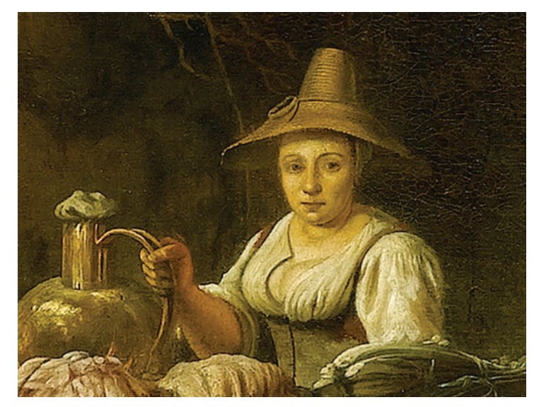
Jan Siberechts, A Wooded Landscape with Peasants in a Horse-Drawn Cart Travelling Down a Flooded Road (Detail)

Jan Siberechts has applied delicate detail to her appearance and costume, thus creating a micro-portrait within the landscape. One can just make out the line of the weave in her conical, wide brimmed hat while her shirt softly plumes beneath a bustier, the folds subtly catching the light. In her right hand she firmly clutches a side-handled metal jug, its mottled surface glistening in the fading light.